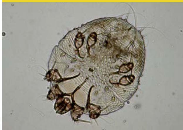
Figure 7: Sarcoptes scabiei

Adult female ticks lay thousands of eggs in vegetation before they die. The following year, six-