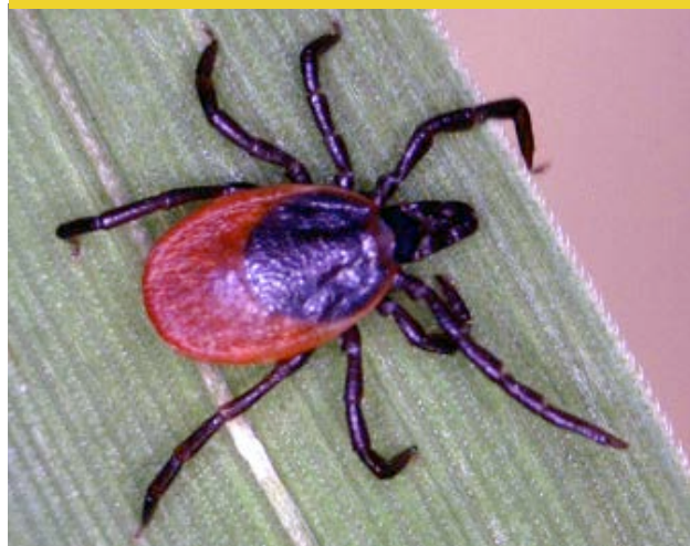
Figure 9: The tick Ixodes ricinus

Ticks may also transmit louping ill virus, which causes an acute encephalomyelitis particularly in sheep and is frequently fatal. It is particularly prevalent in