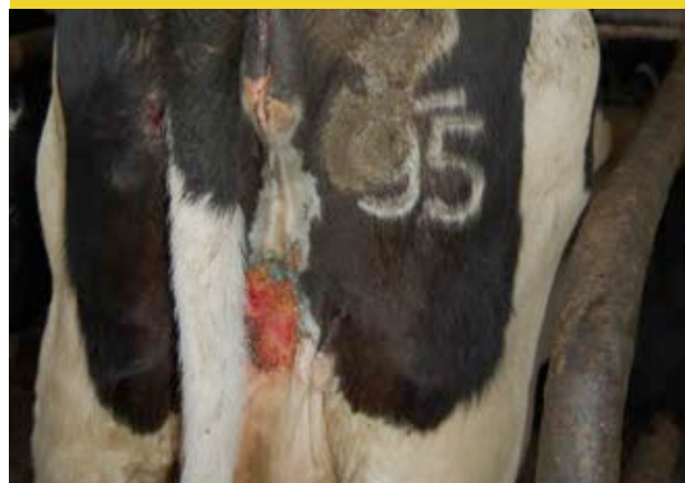
Figure 6: Severe psoroptic mange