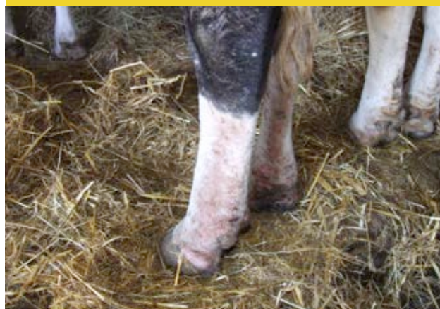
Figure 4: Chorioptic mange on the leg

The precise off-host survival of Chorioptes mites is not definitively known, but is likely to be at least three weeks, depending on temperature and humidity.