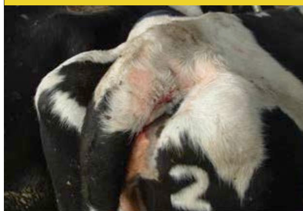
Figure 3: Chorioptic mange on the tail head

This may be completed in only 14 days. All life-cycle stages are found simultaneously on the host and spend their entire lives in intimate contact with their host.