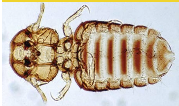
Figure 1: A chewing louse of cattle

This is known as the long-nosed cattle louse. It is often found around the head, neck and dewlap brisket. It is medium-sized with an elongated, pointed