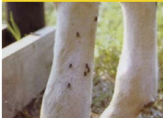
Figure 10: Flies clustering on the leg of a cow

Mechanical transmission may be exacerbated by the fact that some fly species, such as tabanids (horse flies), inflict extremely painful bites, so are frequently disturbed by the host while blood-feeding. As a result, the flies are forced to move from host to host over a short period, thereby increasing their potential for pathogen transmission. The biting activities of