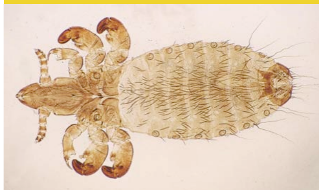
Figure 2: A sucking louse of cattle ( Linognathus vituli )