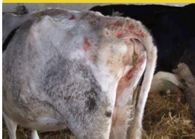
Figure 5: Severe chorioptic mange