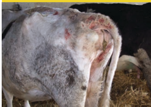
Figure 5: Severe chorioptic mange