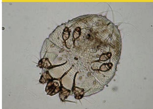
Figure 7: Sarcoptes scabiei

Adult female ticks lay thousands of eggs in vegetation before they die. The following year, six-