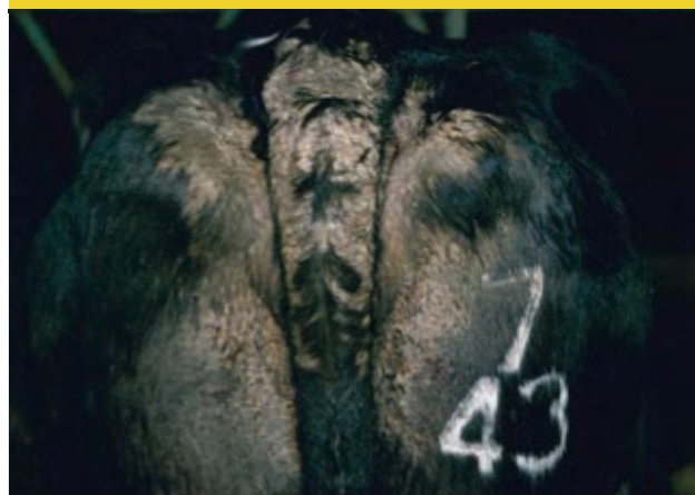
Figure 8: Chronic sarcoptic mange