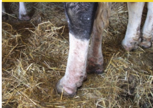
Figure 4: Chorioptic mange on the leg

The precise off-host survival of Chorioptes mites is not definitively known, but is likely to be at least three weeks, depending on temperature and humidity.