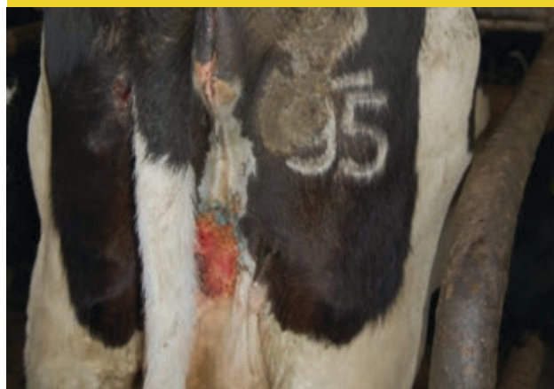
Figure 6: Severe psoroptic mange