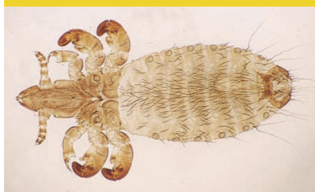
Figure 2: A sucking louse of cattle ( Linognathus vituli )