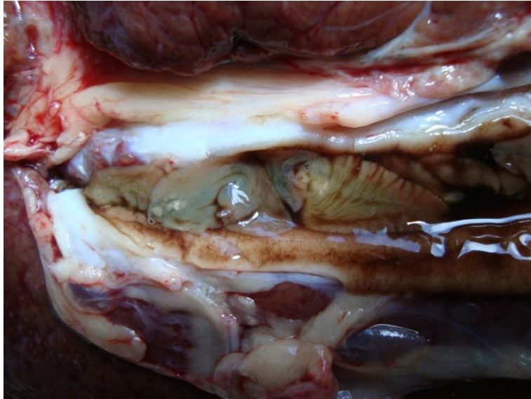
Figure 1. Adult fluke in the bile ducts of a cow.

Mature F. hepatica are large, leaf-shaped trematodes; about 3 to 5cm in length and 1cm in width. They are hermaphrodite; each individual fluke can self fertilize and cross fertilize. Both the juvenile and the adult stages of the parasite feed by secreting enzymes, most notably cysteine proteases, which break down blood and the liver tissue. The parasites are covered in microscopic spines, which irritate the walls of the bile ducts causing hyperplasia of the bile duct epithelium.